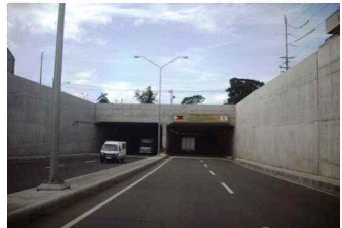
South Coastal Road Tunnel(2010)