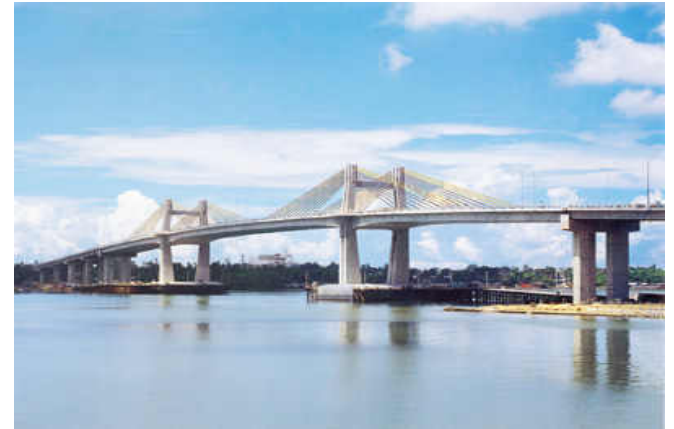
Marcelo B. Fernan Bridge (1999)